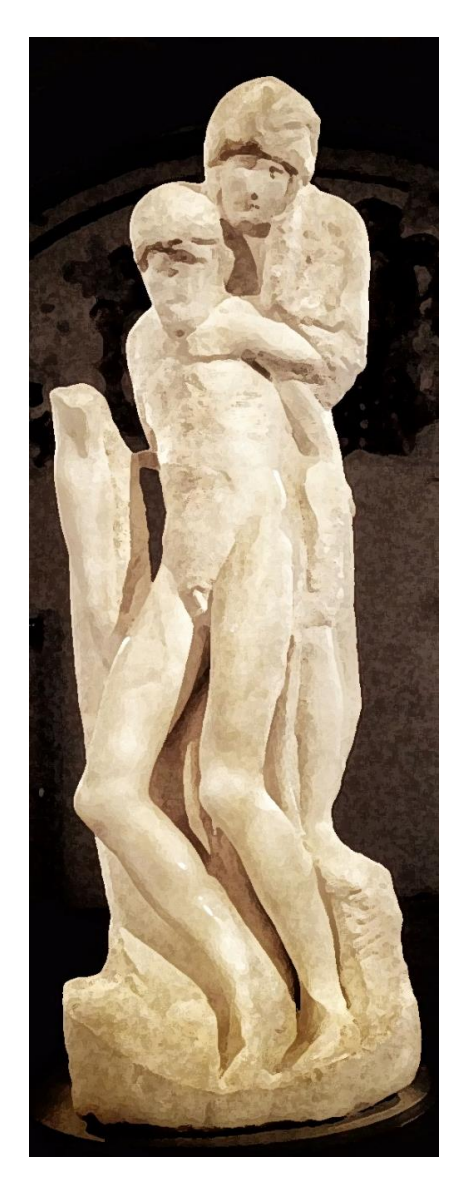
Pietà Rondanini - Michelangelo Buonarroti Museo del Castello Sforzesco di Milano